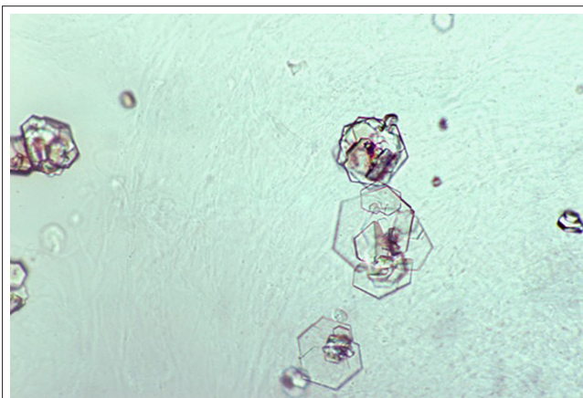
Figure 2. Characteristic hexagonal cystine crystals in urine microscopy.

Stone analysis is the gold standard for determining the type of kidney stone in any patient and similarly can be diagnostic in cystinuria. 2,4,12 Microscopic examination of the first morning urine sample can reveal pathognomonic hexagonal crystals (Figure 2), which is highly specific for cystinuria and can be seen in up to 2/3 of untreated patients. 24,25 For determining cystine hyperexcretion, the sodium-nitroprusside test can be used as the initial screening test. In this qualitative colorimetric test, urine displays a purple color in the presence of high cystine concentration. Although useful as a screening test, it can yield false-positive results in homocystinuria, renal Fanconi syndrome, and patients taking ampicillin or sulfa-containing drugs. 10,25 Thus, positive results need confirmation by quantitative chromatographic analysis of urine for cystine excretion. Measurement of 24-hour urine cystine excretion is the gold standard test for determining cystine hyperexcretion. In healthy subjects, daily urine cystine excretion is <30 mg,