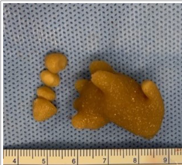
Figure 1. Staghorn calculi in a pediatric cystinuria patient (image courtesy of Dr. Aaron J. Krill, Children's National Hospital, Washington, D.C. We also thank the patient and family for sharing the photo with us and permitting to use).

Stone analysis is the gold standard for determining the type of kidney stone in any patient and similarly can be diagnostic in cystinuria. 2,4,12 Microscopic examination of the first morning urine sample can reveal pathognomonic hexagonal crystals (Figure 2), which is highly specific for cystinuria and can be seen in up to 2/3 of untreated patients. 24,25 For determining cystine hyperexcretion, the sodium-nitroprusside test can be used as the initial screening test. In this qualitative colorimetric test, urine displays a purple color in the presence of high cystine concentration. Although useful as a screening test, it can yield false-positive results in homocystinuria, renal Fanconi syndrome, and patients taking ampicillin or sulfa-containing drugs. 10,25 Thus, positive results need confirmation by quantitative chromatographic analysis of urine for cystine excretion. Measurement of 24-hour urine cystine excretion is the gold standard test for determining cystine hyperexcretion. In healthy subjects, daily urine cystine excretion is <30 mg,